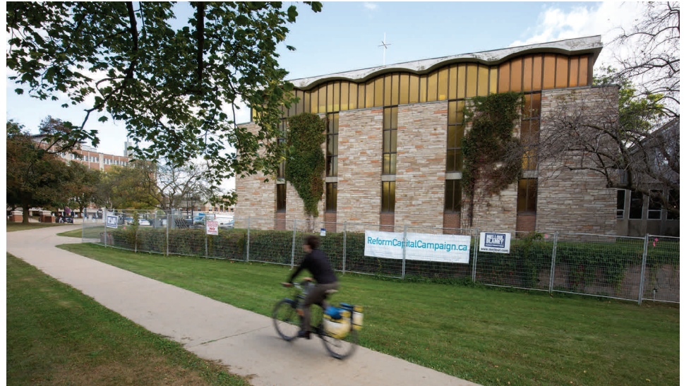
A cyclist rides by the new capital campaign banner on the fence around the seminary.