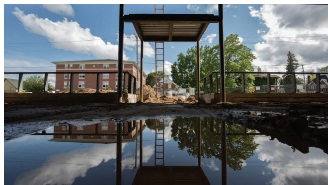
The view from under the steel structure built for the new entrance, offices and foyer on Bricker Avenue.

So during October the seminary is making a concerted effort to inform parishioners, pastors and alumni throughout the Eastern Synod about the campaign and is inviting them to participate. As a result,