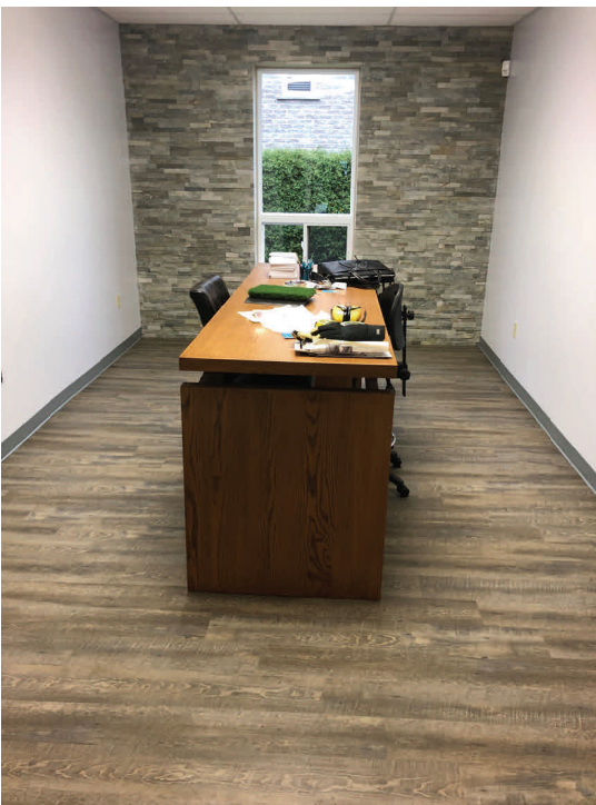
Above: Early Years Office at 236 Woodhaven Road