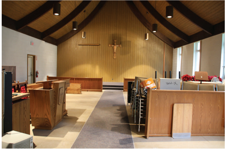
A look at the sanctuary before the renovations begin.