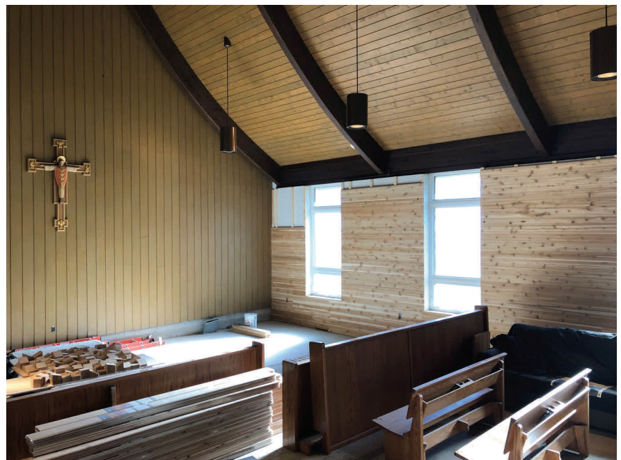
Right: The transformation into a new healing place begins.