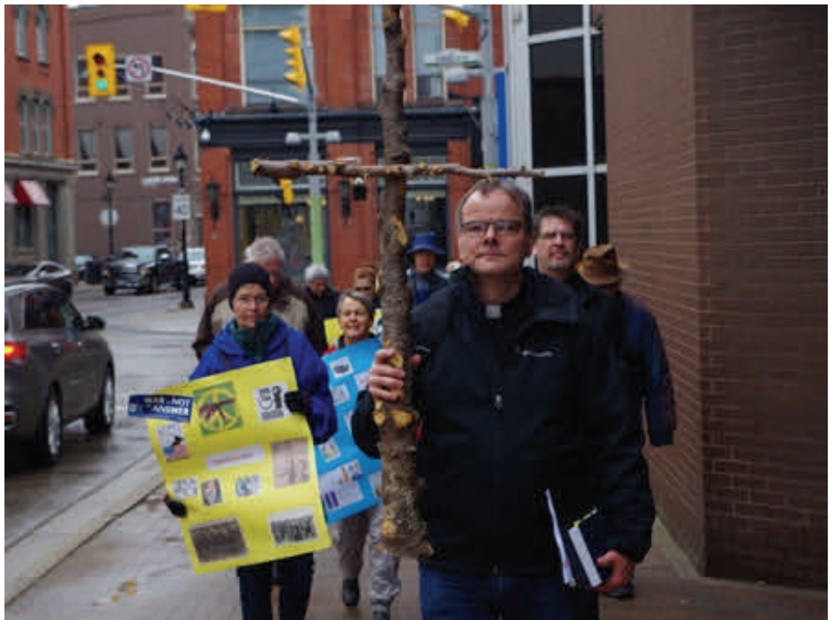
The theme for the stations was, Against the Forces of Death; Embracing the Faces of Poverty: Kitchener, Good Friday 2019

The two communities made their way from station to station carrying the cross, reading scriptures and praying at each location. Discussions unfolded at each station.