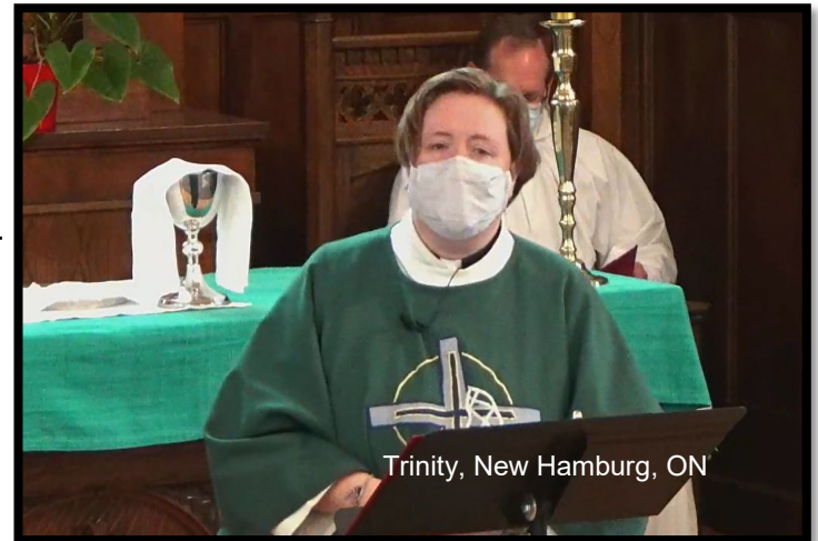
Trinity, New Hamburg, ON

not to resume in-person worship. For others, in-person worship resumed and then had to