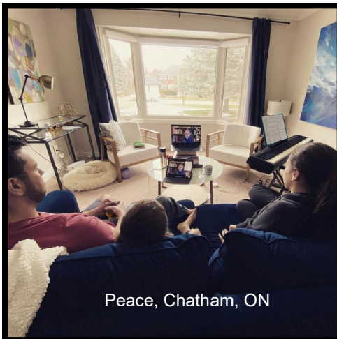
Peace, Chatham, ON

The synod's Task Force for the Resumption of In-Person Worship has been working since June, 2020. Our initial mandate was to provide resources to enable congregations to assess their own situation and to develop protocols so that they could safely resume worship in-person. For some congregations, that meant coming to the difficult decision