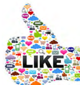
"See how social media can impact our faith life"

Registration and meal cost is $15.00, which includes coffee breaks, lunch and all materials.