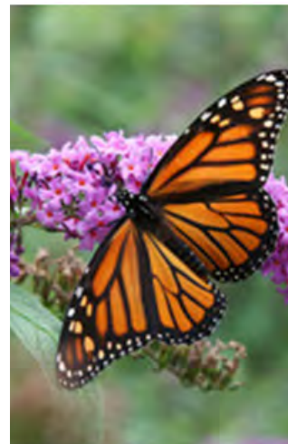
“We as Christians, have a perfect example of a Butterfly Effect – the ULTIMATE BUTTERFLY EFFECT - our Lord and Saviour Jesus Christ.”

The day ended with a short devotion. A good time was had by all.